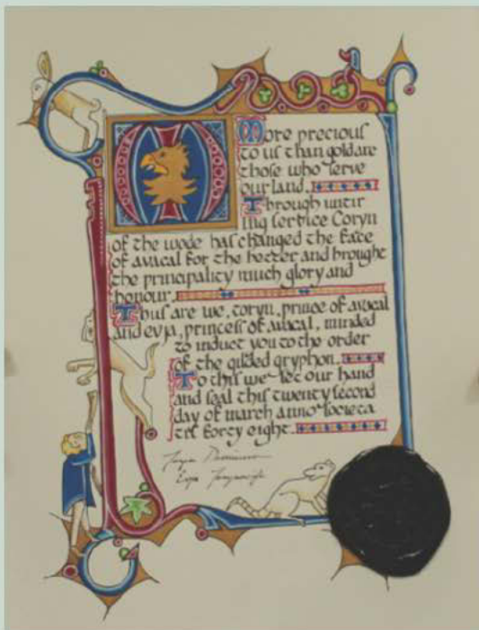
Artwork and Awards of Avocal