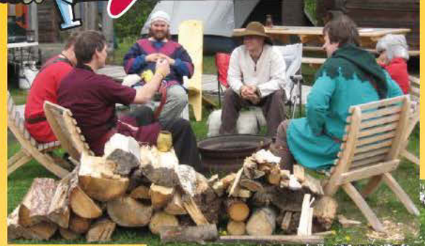
Story and all Photo's by Cynwulf