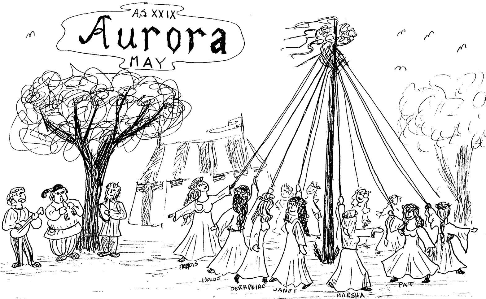
THE "MAIDENS" OF BOREALIS