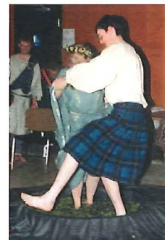
Dancing In The Grapes