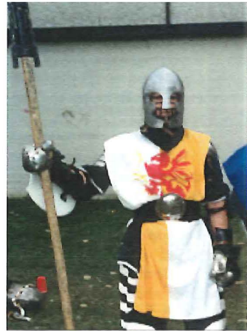
His Highness Angar Ninefingers