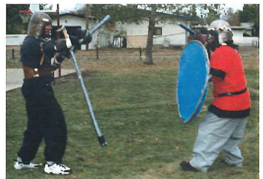
Pick-up Fight At Vinfest