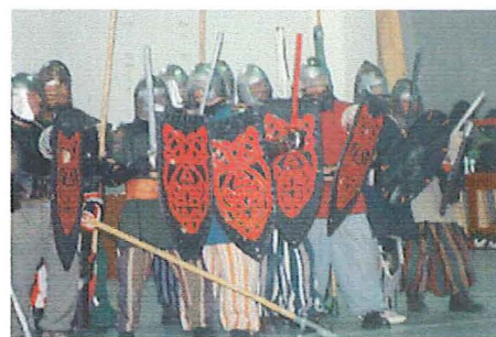
The Lost Vikings at Winter War

The scissors cut easiest past the buttonhole.